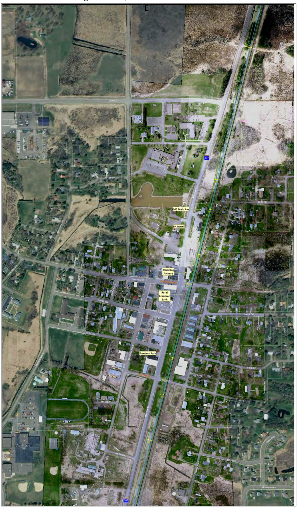
Exhibit E.2 NLX Corridor through Braham, MN